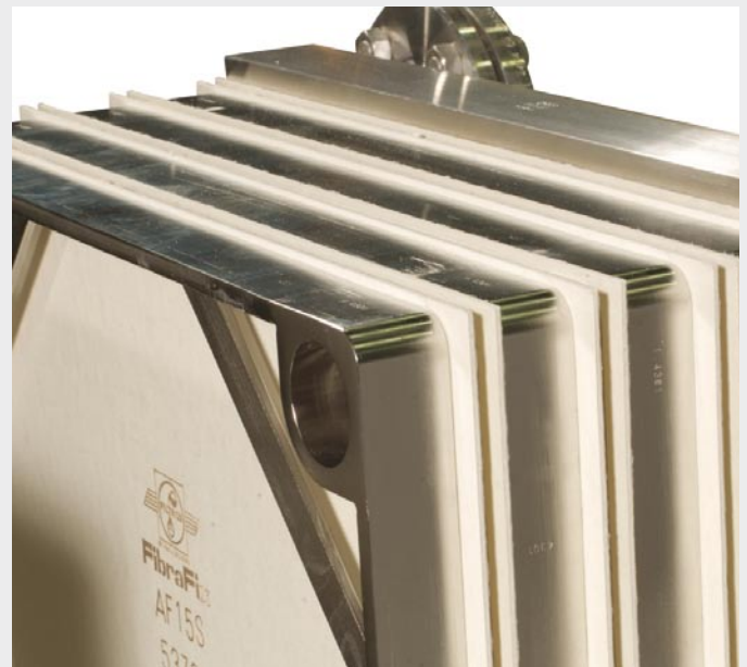
NOVOX® OD 600, plates and draff frames, equipped with filter sheets.

Material in contact with product: stainless steel..... 316L/316 Ti Other parts: stainless steel..... 304